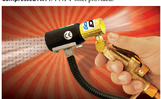
80% of the delivered air is induced, minimizing air consumption of the Gen4 Ion Air Gun.

Maximum Ambient Temperature: 165°F (74°C) Compressed Air: 1/4 NPT inlet provided.