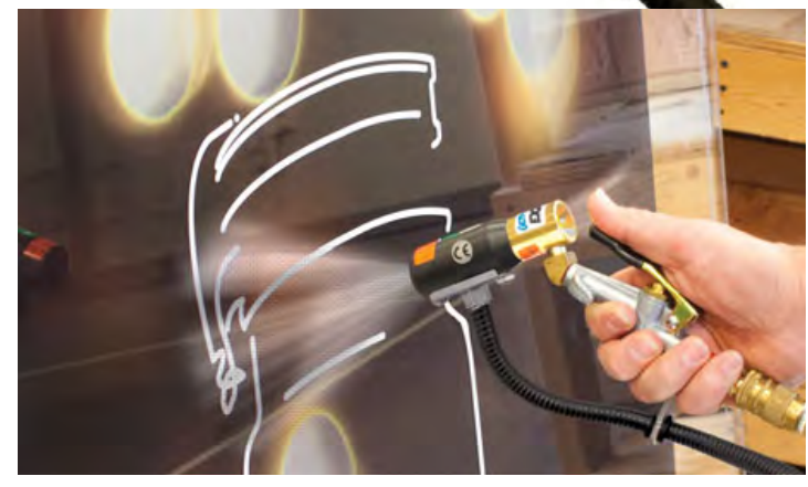
The Model 8293 Gen4 Ion Air Gun cleaning artwork and glass prior to framing.

The Gen4 Ion Air Gun is quiet, lightweight and features a hanger hook for easy storage. The 10 foot (3m) armored and electromagnetic shielded power cable is extremely flexible, designed for rugged industrial use.