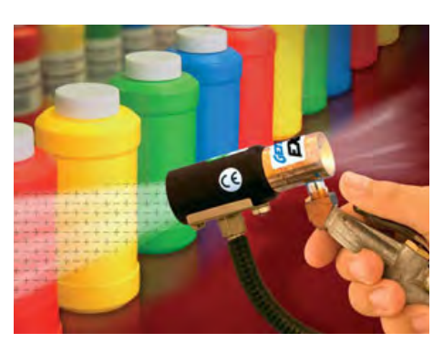
The Model 8293 Gen4 Ion Air Gun neutralizes and cleans plastic bottles prior to labeling.