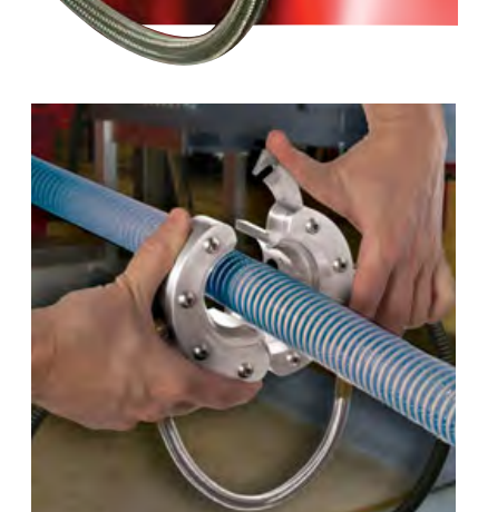
The split design unlatches easily to fit around the moving part - no threading required.