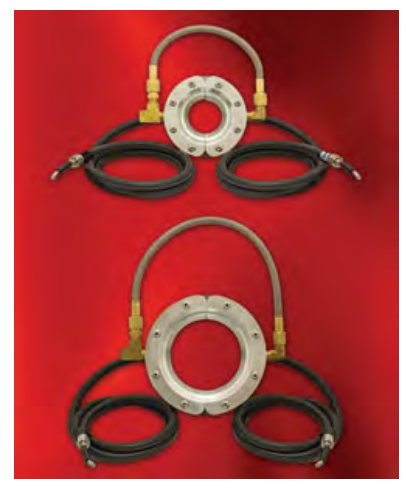
The Gen4 Super Ion Air Wipe is available in a 2" (51mm) and 4" (102mm) diameter.