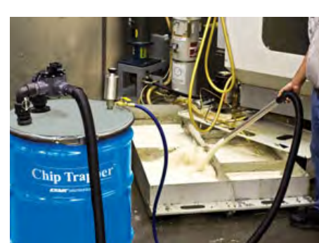
The Chip Trapper pumps the coolant back into the sump - free of chips and debris.